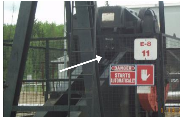
Trial magnetic filter rod location in gear box of a LeGrand 160. (Arrow indicates gear box.)

Filter rods are easily cleaned with a wipe of a cloth, have a warranty of 3 years and an effective life of 10+ years.